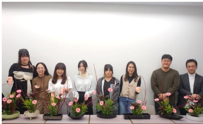
Flower arrangement club