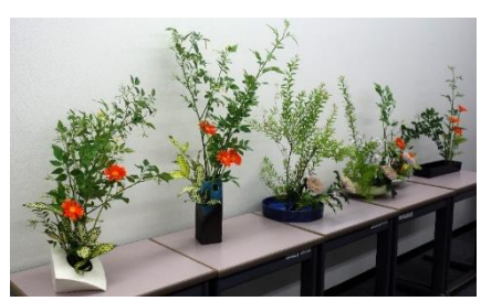
■ Tea ceremony Club