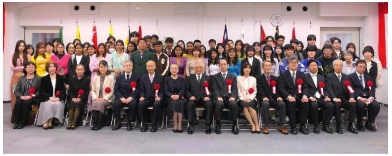
2024年4月4日 2024年度 第38回 春期入学式 ** 東京國際大學出本語学

We wish you all the best in your Japanese study as you pursue your own goals.